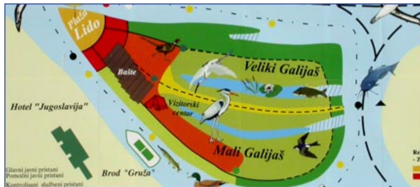
Scheme of the "Great War Island"

The Biodiversity Picnic in Serbia was organized by the Faculty of Applied Ecology "FUTURA" University "Singidunum" Belgrade, with the support of CEEWeb and UNEP Regional Office for Europe, in the area of Special Nature Reserve "Veliko ratno ostrvo" ("Great War Island"), located at the mouth of the Sava river into the Danube.